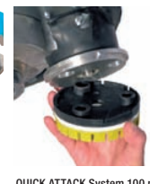
QUICK ATTACK System 100 mm