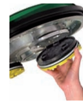
QUICK ATTACK System 140 mm