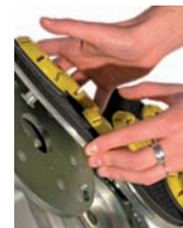
QUICK ATTACK System 200 mm